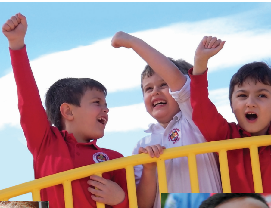
Annual Report Fiscal Year 2018: July 1, 2017 – June 30, 2018